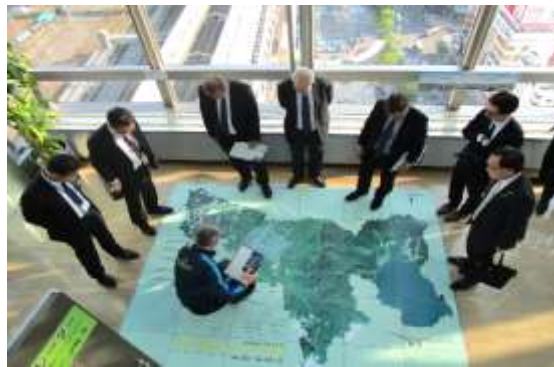
Fureai Science Park