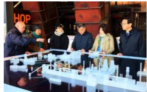
Zollverein Coal Mine Industrial Complex in Essen