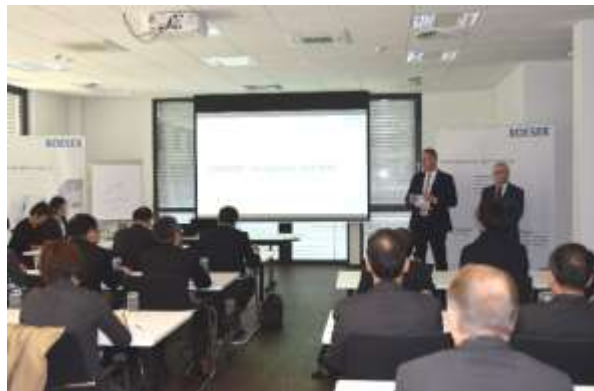
ROESER Medical GmbH