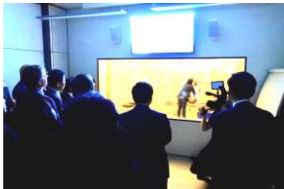
Universität Duisburg-Essen Medizinische Fakultät, Lehr- und Lernzentrum (LLZ)