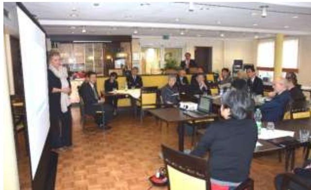
Contilia GmbH, Seniorenstift Haus Berge