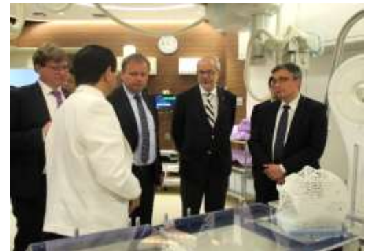
BNCT Research Center, Southern Tohoku General Hospital