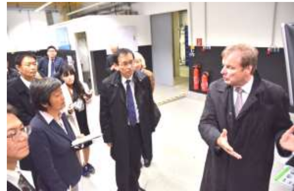
GWl (Gas- und Wärme-Institut e.V.)