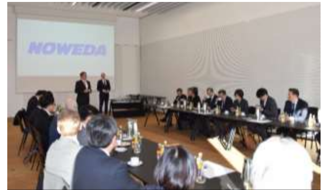
NOWEDA Apothekergenossenschaft eG