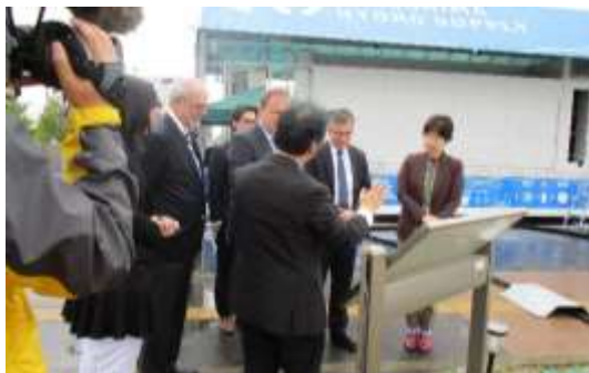
Fukushima Renewable Energy Institute, AIST( FREA)