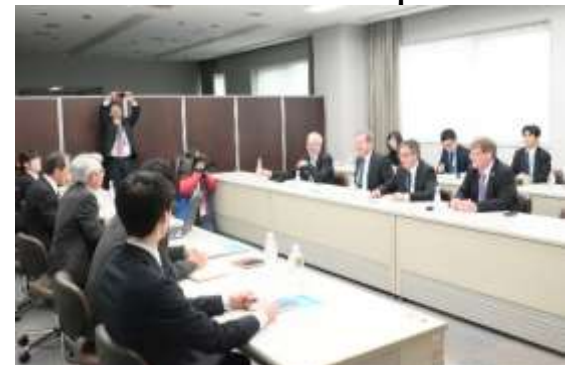
Energy Agency. Fukushima