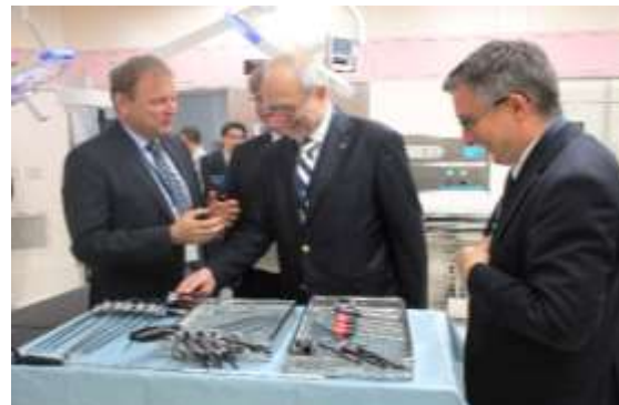
Fukushima Medical Device Development Support Centre