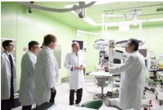
College of Engineering, Nihon University