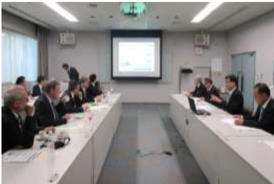
Fukushima Technology Center