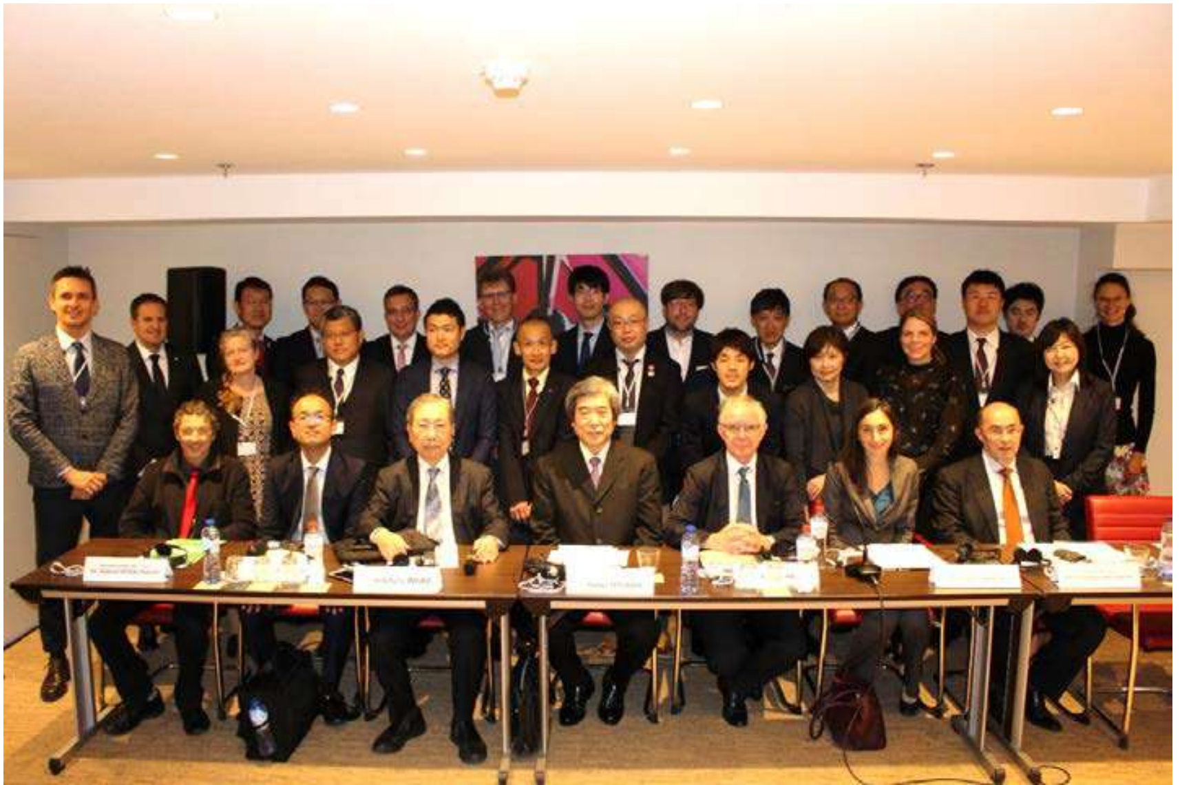
3rd Exchange Meeting of EU and Japanese Cities in Brussels, 11 Oct 2018