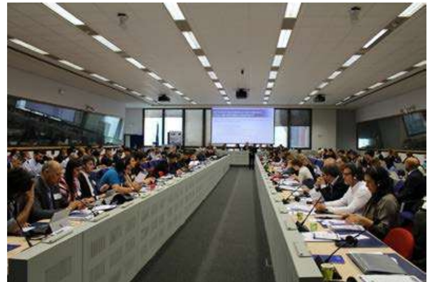
City-to-city event in Brussels, Oct 2018