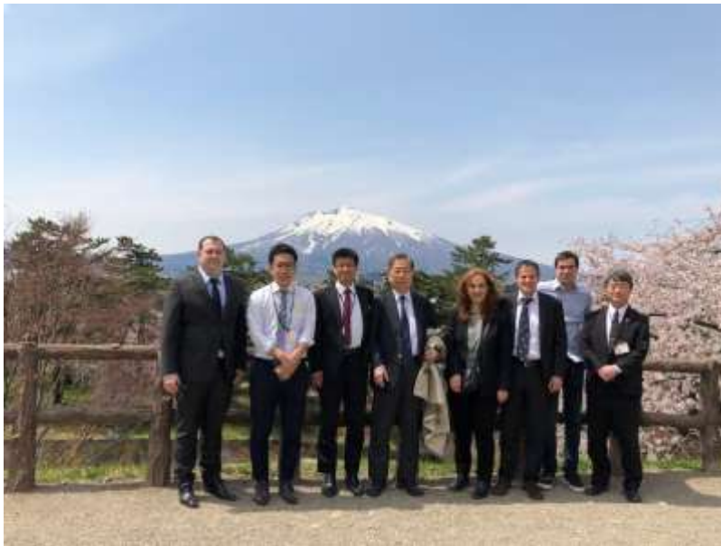
Donostia-San Sebastian in Hirosaki, April 2018