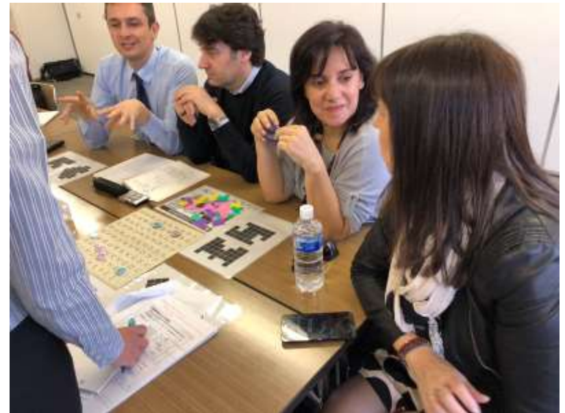
Ancona in Ikoma, April 2018