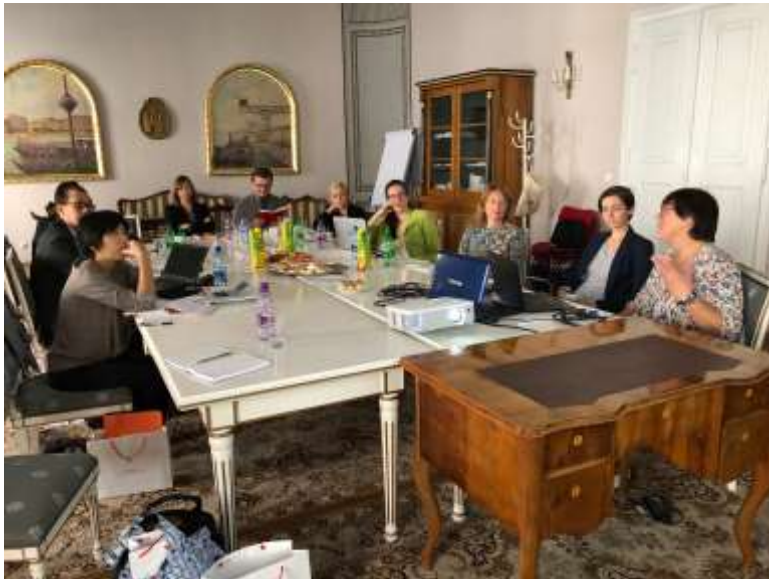
Tokorozawa in Bratislava, Oct 2018