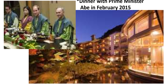
*Dinner with Prime Minister Abe in February 2015