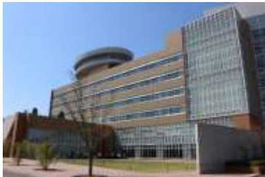
*College of Engineering, Nihon University (LOHAS and Medical Engineering)