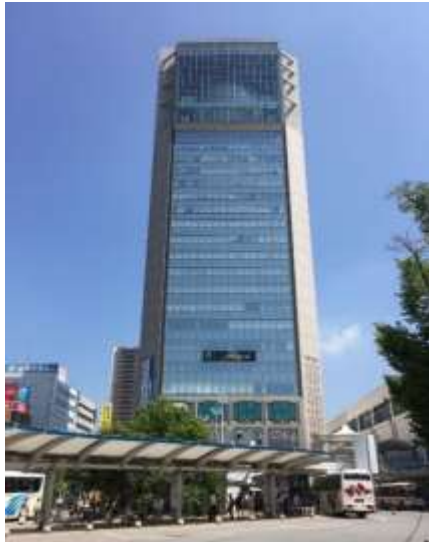
✓ 'BIG i', the highest building in Fukushima Prefecture , with the height of 104.25 meters above ground level, recognized in the Guinness Book of World Record for the planetarium located at the highest point in the world