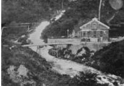
Numagami Hydroelectric Power Station, laid the foundation of Koriyama's development

5. Great East Japan Earthquake and Nuclear Accident at Fukushima Daiichi Nuclear Power Station in 2011