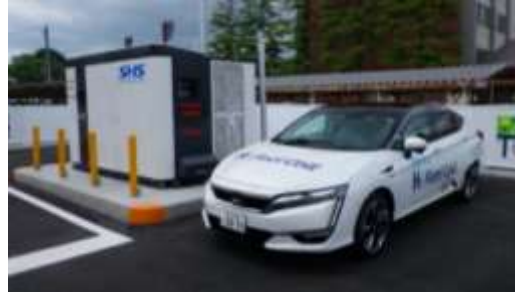
✓ Operating Hydrogen Refueling Station and Fuel Cell Vehicle (FCV), toward a front-runner in using hydrogen as power source