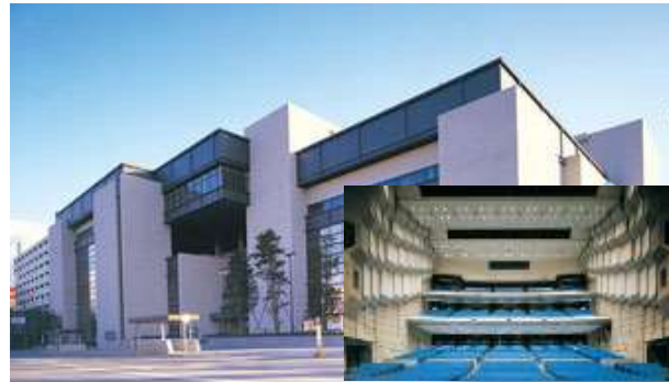
✓ 'Koriyama Kenshin Cultural Center' one of the largest concert halls in Tohoku Region, boasting 2,004 seats for its main hall