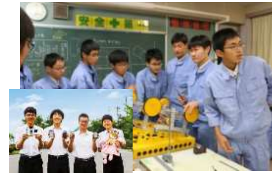
✓ 'High School of Robotics' the computer club of Koriyama Kita Technical High School , won the prizes in four consecutive year until 2016 at the International Contest of Applications in Nano-micro Technology (iCAN), won the first prize at "Pro ROBO" in 2014