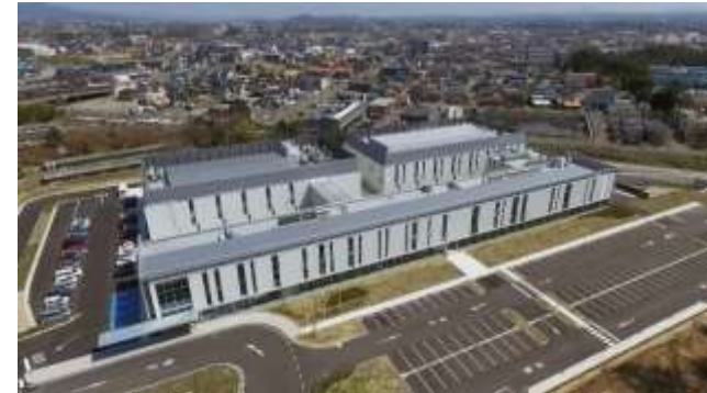
✓ Fukushima Medical Device Development Support Center (FMDDSC), support for the development and business of Medical Device