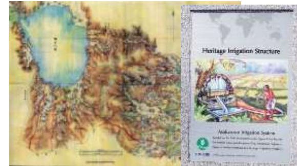
✓ Asaka Canal, one of the ICIID Heritage Irrigation Structures, designated by International Commission on Irrigation and Drainage (ICID) in November 2016