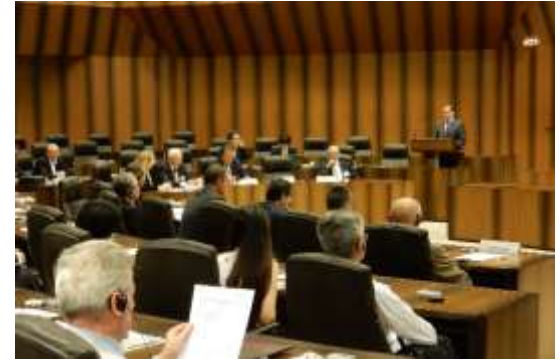
✓ Essen-Koriyama Joint Seminar, lecture presentations given by the delegation members from Essen City for businesses and research institutes in Koriyama City