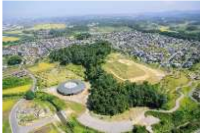
Oyasuba Burial Mound, built in the early Kofun Period (250 AD-538 AD)