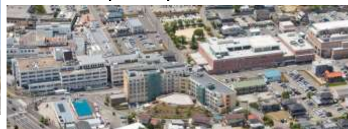
✓ The Southern Tohoku General Hospital, collaboration with the Essen University Hospital, the cutting-edge Boron Neutron Capture Therapy (BNCT) research