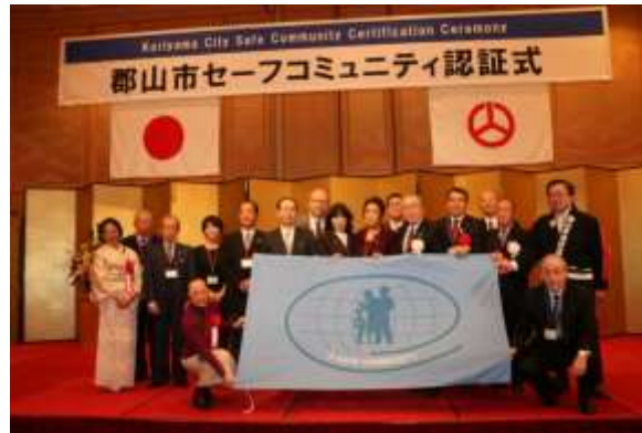
✓ Certified as one of the International Safe Communities sponsored by WHO in February 2018, 1 st city in the prefecture, 15 th in Japan and 391 st in the world to become the International Safe Community, aiming at realizing a safe and secure community