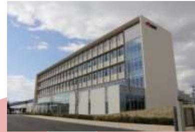
Fukushima Renewable Energy Institute, AIST (FREA) opened in April 2014

1. Post Station at Oshu Kaido [Edo Period (1603-1868)]