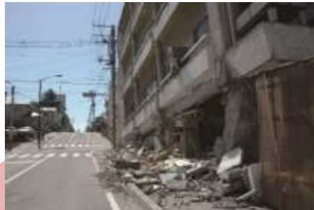
Building with its first floor collapsed due to the fierce earthquake

5. Great East Japan Earthquake and Nuclear Accident at Fukushima Daiichi Nuclear Power Station in 2011