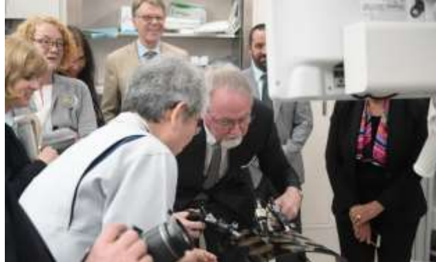
✓ Fukushima Medical Device Development Support Center (FMDDSC), visiting to the first center in Japan which supports the development and commercialization of medical device