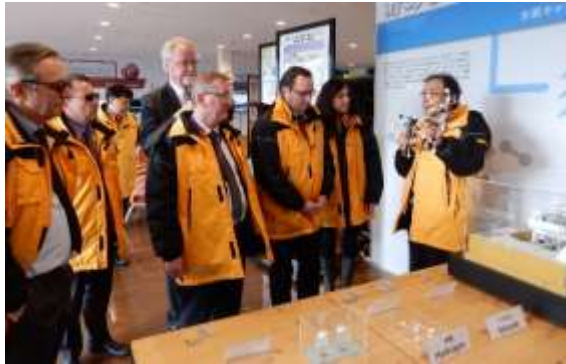
✓ Fukushima Renewable Energy Institute, AIST (FREA), visiting to the world-leading institute of renewable energy