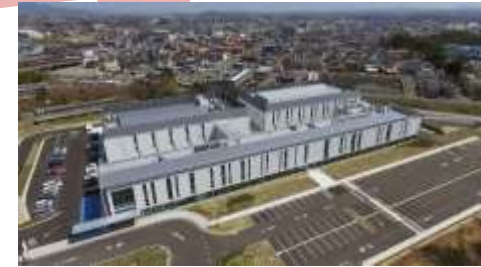
Fukushima Medical Device Development Support Center (FMDDSC) opened in November 2016

6. Restoration from the disasters, promoting renewable energy and medical device development