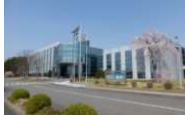
*Fukushima Prefectural Technology Centre