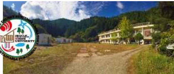
✓ Collaboration of research on geothermal with the College of Engineering, Nihon University, providing abolished school in Konan-machi which located at the south bank of Lake Inawashiro as a test bed, http://mech.ce.nihon-u.ac.jp/~oguma