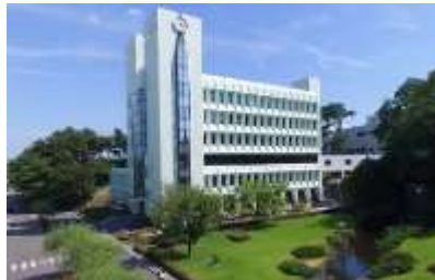
*Ohu University (Medicine)