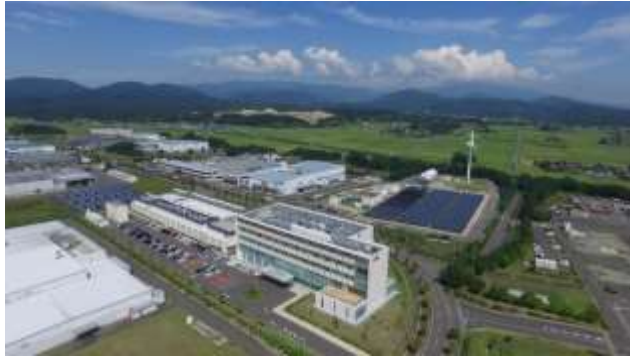
✓ Collaboration with Fukushima Renewable Energy Institute, AIST (FREIA), hub for the research and development on renewable energy

-Focusing on the hub among industry, academics and government and International Safe Community by WHO-