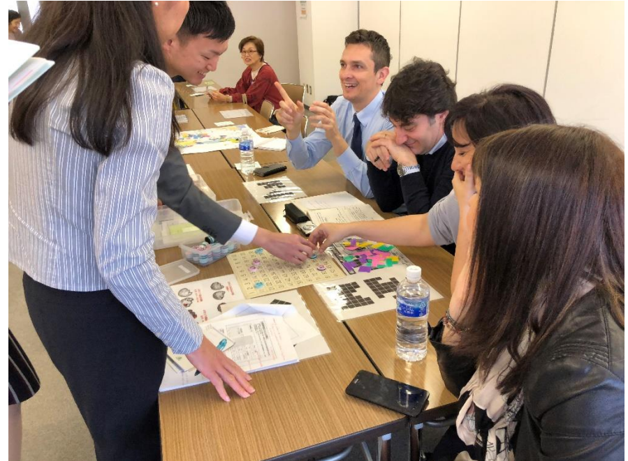
Ancona learns Ikoma's "smart aging" method